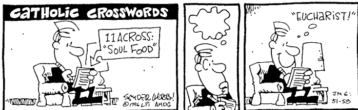
THE BODY & BLOOD OF CHRIST

Do you remember when you were part of First Communion, a Wedding or Confirmation? For one hundred and forty years St. Brigid's parishioners have been living the gospel and sharing the future dreams of their children and family. You own a valuable piece of history for the Catholic community in Amherst. Now more important than ever!